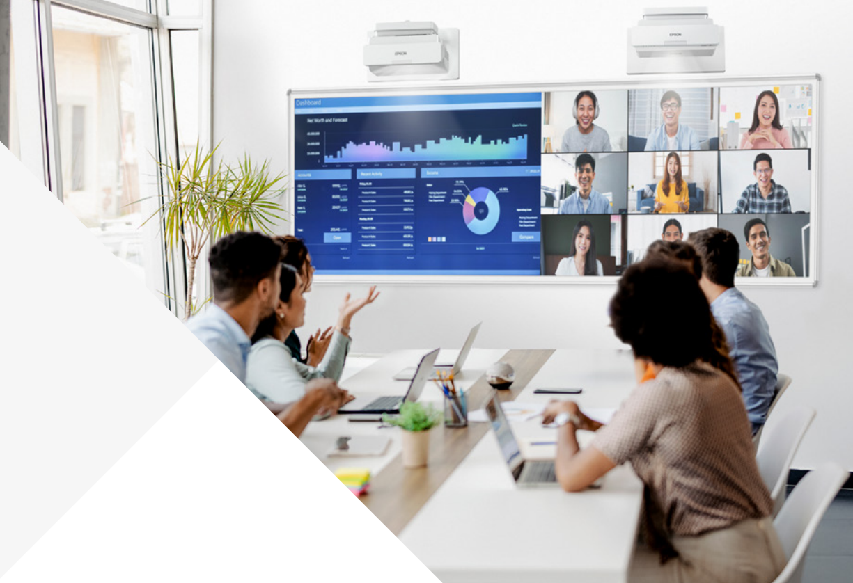
Meeting attendance by location

Entire walls becoming a projected image to create a truly immersive experience that isn't possible with a flat panel, and too expensive with an LED wall display.