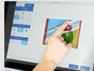
Smooth operation with 22 inch multi-touch screen and intuitive software.