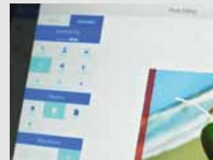
Epson which auto image corrects prints Auto Photo Fine.