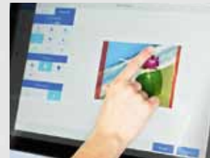
Smooth operation with 22 inch multi-touch screen and intuitive software.