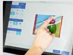
Smooth operation with 22 inch multi-touch screen and intuitive software.