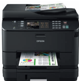
Epson WorkForce Pro WP-4545DTWF

We respond to the demands of today's business world with the philosophy that if a desired product does not exist, we will create it.