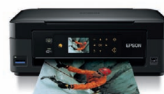
Epson Stylus SX440