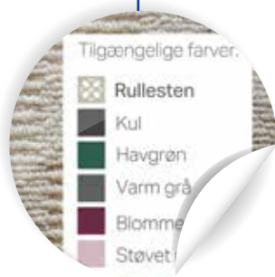
Indicate other colours available in the range