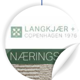
Present company logo in brand colours