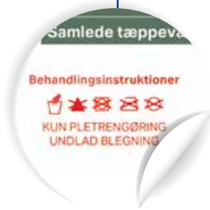
Highlight key care instructions