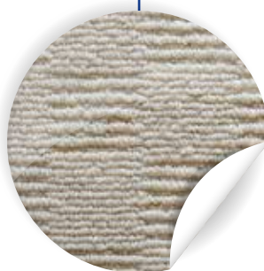
Show colour and texture of product