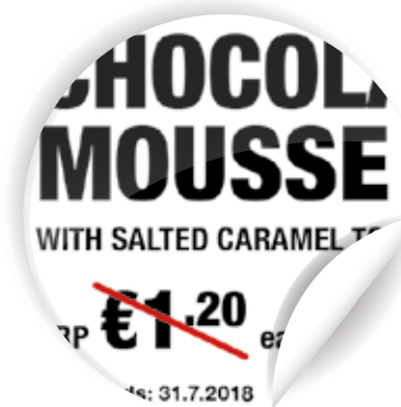
Highlight price changes