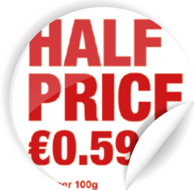
Create eye-catching Special offers