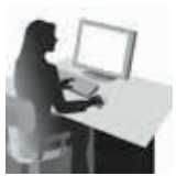
Create a design