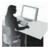
Create a design