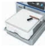
Remove lint and smoothen surface