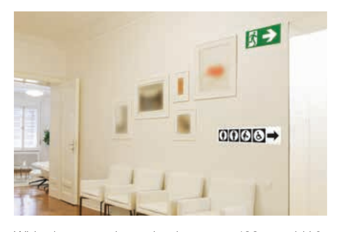
Wide signage and security signs up to 400mm width<sup>2</sup>