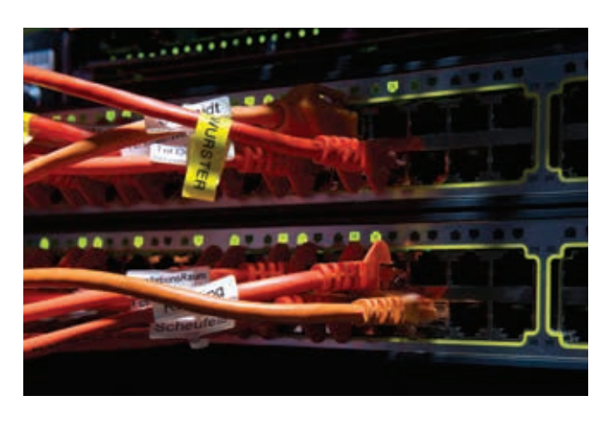
Special formats and materials for cable identification: vertical and horizontal flag, self-lamination wrap around and Heat Shrink Tubes