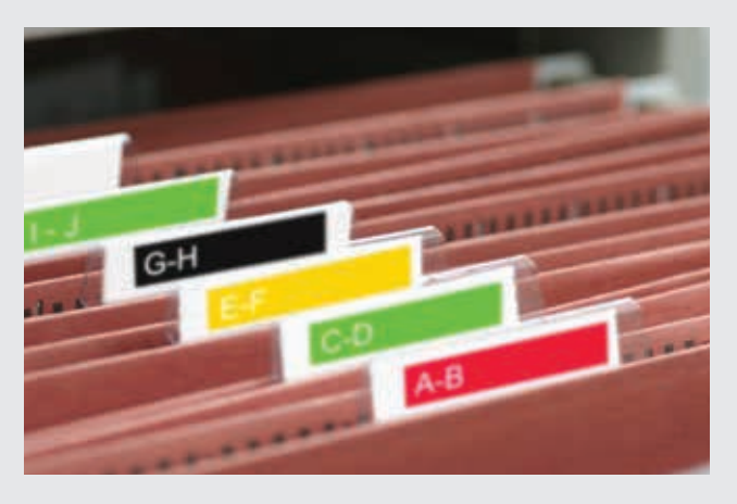
For the organised office and workspace

For app designers, by adding a labelling feature to your app (SDK available) and linking it to our label makers, you can enhance your business solutions and processes.