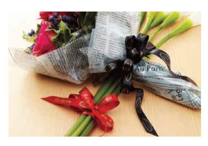
Gift wrapping at the POS