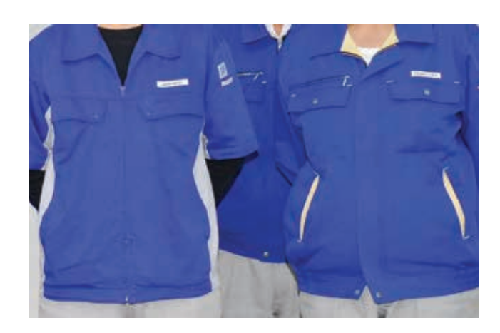
Iron-on labels for identification in the workplace