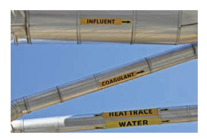
Pipe marking in industrial environments