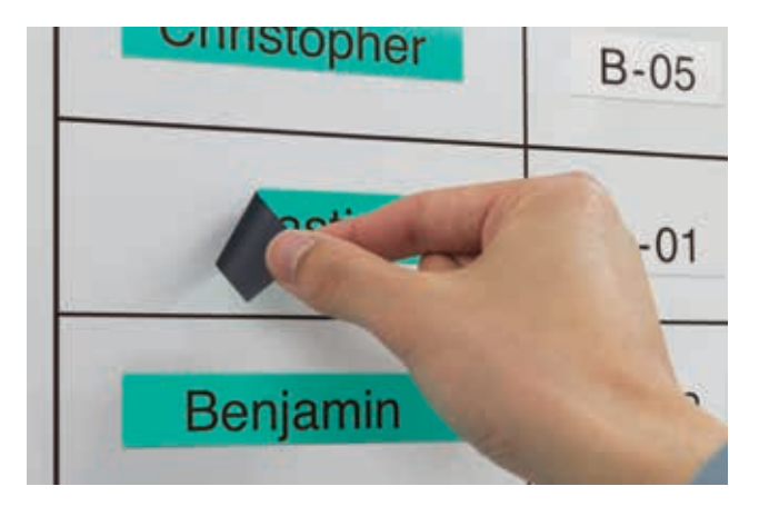
Product and schedule management