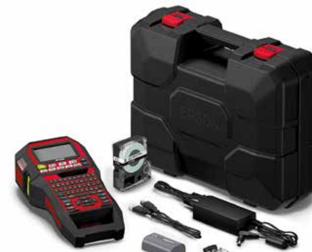
Full kit included