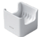
Tray for transmitters