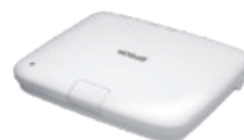
Receiver (base unit)