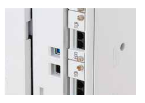
Super G3/G3 fax board

Authentication table A device table can be added, along with third-party card readers.