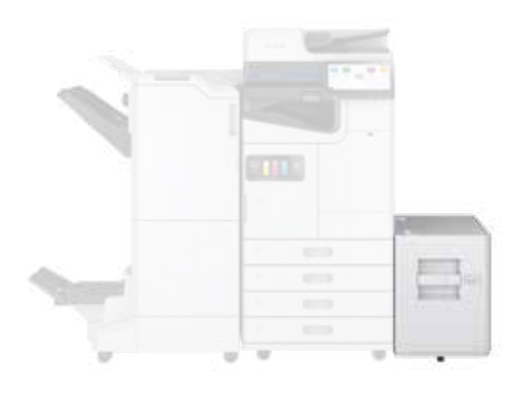
High-capacity paper tray

One fax line can be installed on AM-C400/550. Up to 3 optional fax lines can be installed on AM-C4000/5000/6000 only.