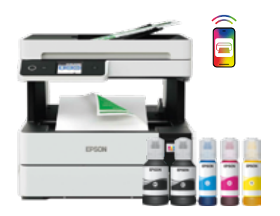
Print, copy and scan ET-5170 also features fax 250-sheet front tray 35-sheet automatic document feeder Connectivity: Wi-Fi, Wi-Fi Direct and Ethernet Compatible with Epson Smart Panel app Easy mobile printing Epson PrecisionCore technology Apple AirPrint compatible 6.1cm colour touchscreen 1 year / 100,000 pages warranty<sup>14</sup> 113 ink series: 1 full set included + 1 extra black