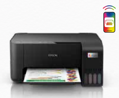
EcoTank ET-2810 series

104 series 1 full set included + 1 extra black