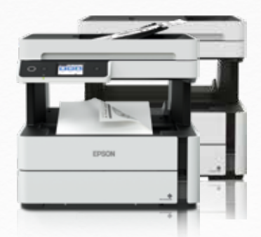
EcoTank ET-M3170 series

Print, copy, scan and fax ET-M3180 features PCL support 6.1cm colour touchscreen 35-sheet automatic document feeder Automatic double-sided printing Epson PrecisionCore Heat-Free technology 250 sheet front-loading paper tray Connectivity: Wi-Fi, Wi-Fi Direct and Ethernet Easy mobile printing 1 year / 100,000 pages warranty<sup>15</sup>