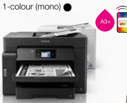
EcoTank ET-M16600 series

Print, copy and scan ET-M16680 features PCL support Ultra-fast print and scan speeds Dual paper-loading: 2 x A3 250-sheet front tray, 50-sheet rear feed 50-sheet high-speed document feeder Connectivity: Wi-Fi, Wi-Fi Direct and Ethernet Compatible with Epson Smart Panel app Easy mobile printing Epson PrecisionCore technology 6.8 cm colour touchscreen 1 year / 150,000 pages warranty 15