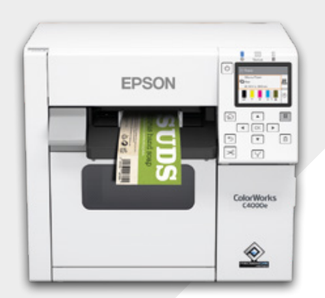
ColorWorks C4000e series