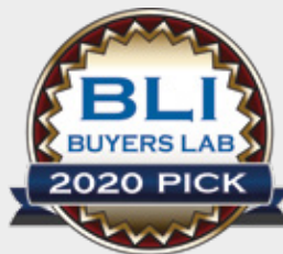
Epson EcoTank L6580 Outstanding SOHO Colour Inkjet All-in-One

The Epson EcoTank L6580 has claimed a BLI Summer 2020 Pick Award for Outstanding SOHO Colour Inkjet All-in-One.