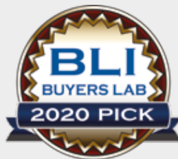
Epson EcoTank ET-5880 Outstanding SOHO Colour Inkjet All-in-One

The Epson EcoTank ET-5880 has claimed a BLI Summer 2020 Pick Award for Outstanding SOHO Colour Inkjet All-in-One.