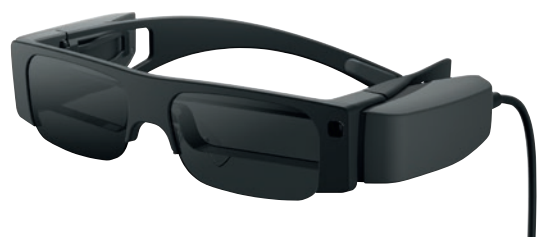
BT-40 showing the optional dark shade attachment.