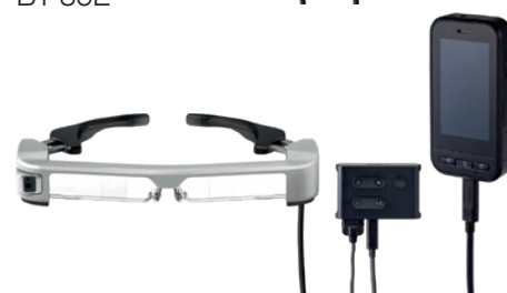
BT-35E Solution Pack