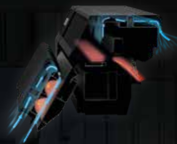
Anti dust design heater