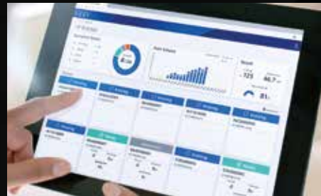
Epson Cloud Solution PORT

High image quality is achieved by three Epson print technologies – Halftoning, fully optimised LUT and Micro Weave – reducing graininess and banding. Fully controlled heating and curing technology, combined with the long-life PrecisionCore printhead, provide reliable colour consistency across the entire length of the print run. This avoids the need for reprints due to mismatched colours.