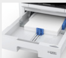
500-sheet paper cassette