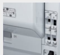
Ethernet/Fax port options (WF-C879R only)