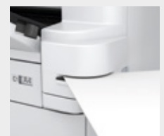
Stapler (WF-C879R only)