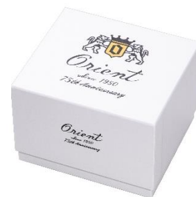
■ 75 th Anniversary box