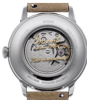
■ Case back with anniversary marks and engravings (RA-AK0808S)