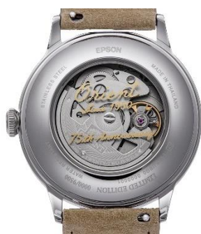
■ Case back with anniversary marks and engravings (RA-AC0027S)